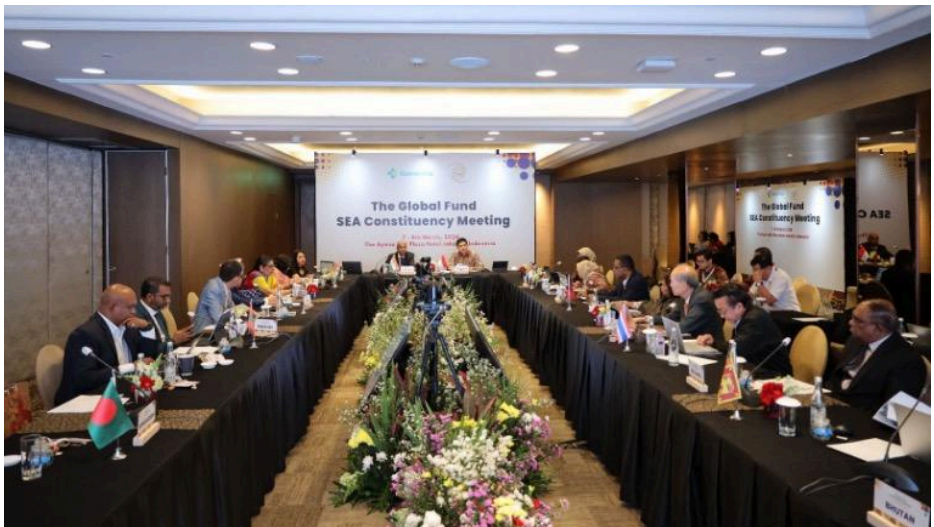
Figure 1. SEA Constituency meeting 2024.