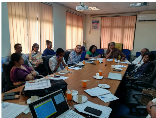
Figure 4. CCM Sri Lanka Oversight Committee Meeting, 17 August 2024.

An update was also provided on the capacity-building workshop on the Protection of Sexual Exploitation, Abuse, and Harassment (PSEAH) held in Kuala Lumpur, Malaysia, by the Global Fund's PSEAH Unit, which Sri Lanka participated in. This meeting is part of CCMSL's quarterly activities, serving as a vital tool for monitoring and evaluation.